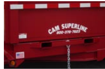
Pallet Fork Carrier & Tie Down Rail